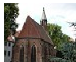
Corpus Christi Chapel