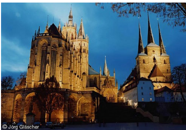
Erfurt – Cathedral Square