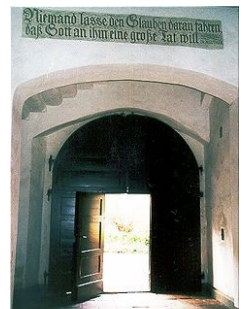
Preacher's Seminary Entrance

Student groups, studying in Wittenberg, have also traveled on to other cities like Erfurt, Heidelberg or Berlin to use them as points of study and departure.