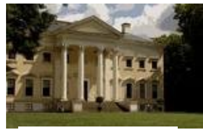
Palace in Wörlitz Park