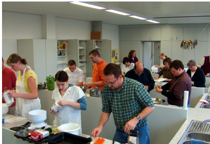
Learning in the Vo-Tech School

It might be as simple as wanting to volunteer or to engage in more extensive “service learning”. The Center has connected students with opportunities to assist the local churches and social ministry agencies. At a more formal level, we can work with our local German partners to provide internships. In addition to providing practical experience, the German internship allows a student to make contact with the local people and to experience daily German life. Students might work in retirement homes, hospitals or diaconal ministry settings, they might teach English in local Kindergartens and primary schools; they might work in one of the town’s chemical firms or with the Luther Memorial Foundation. We encourage questions and requests for other learning experiences that would be appropriate for your students